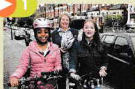
0.1 Intro Video